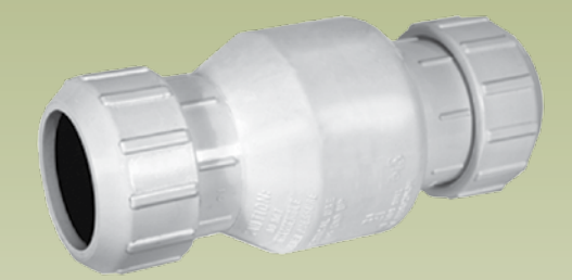
CVSE1, CV-SE2 and CV-SE3