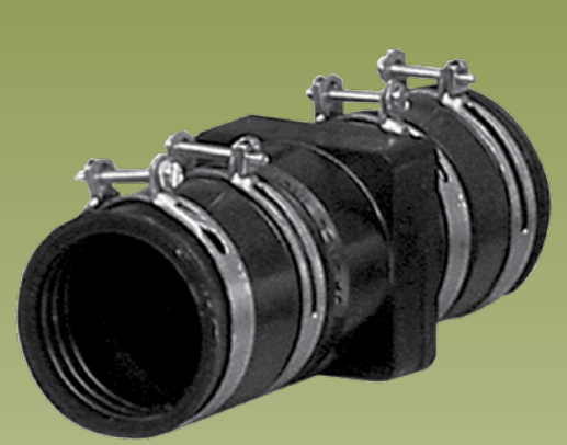
CV-114/112 and CV-SE